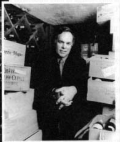
Robert M. Parker, Jr., ABOVE, is a keen champion of the wines produced in the limestone-soil vineyards of California's Paso Robles region.